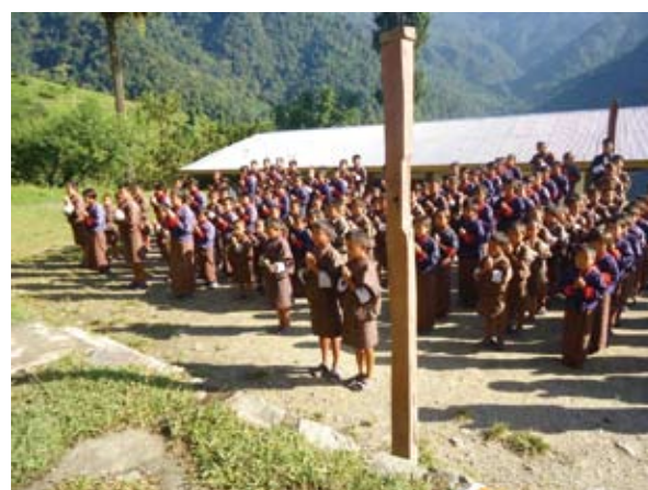
Photo. 6 Primary Students Pray in a Morning Assembly

line is set at 4 points out of 10. If a student scores just 4 it is considered to be a bare minimum pass mark and he/she is living on baseline of poverty. But any score below it, i. e., 1-3, is below baseline and therefore a student is destined to be living in the world of Cultural Poverty. It is the responsibility of teachers, students