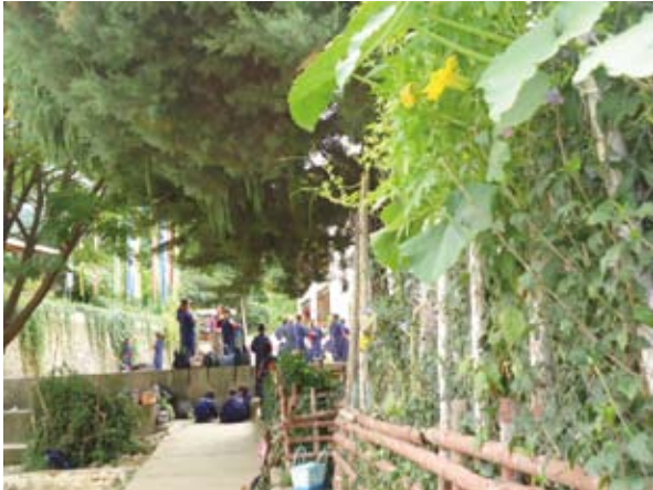
Photo. 2 A GNH School