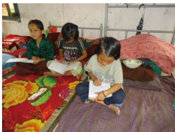
Photo. 5 Girls Study in Hostel