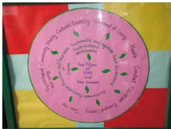
Photo. 1 GHH Pillars & Domains

The section presents a brief literature review on concepts and forms of culture and Gross National Happiness (GNH) ; poverty and cultural poverty ; and types, causes and consequences of youth violence.