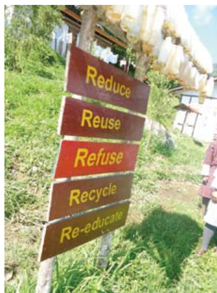
Photo. 4 GNH Practices