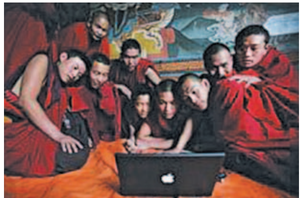
Photo 10 Monks trying out a laptop