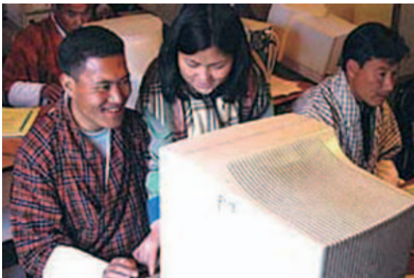
Photo 6 Getting a lesson on IT