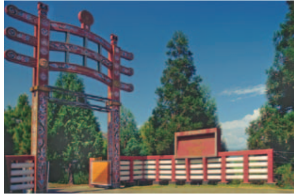
Photo 9 Sherubtse College, Kanglung