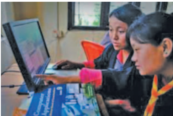
Photo 7 Students in a Community Center