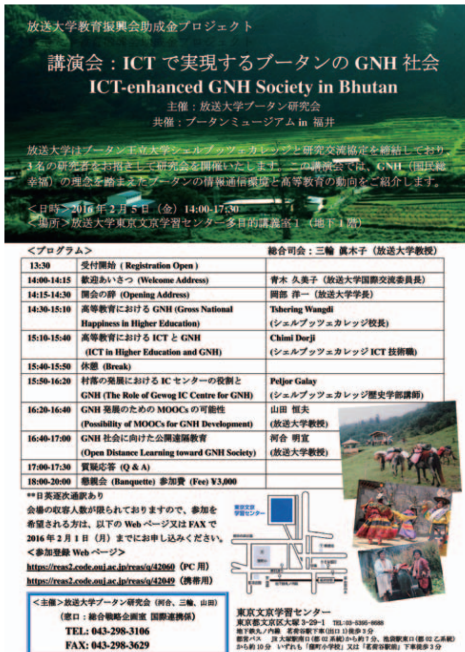
Figure 1 (図1) ICTで実現するブータンのGNH社会