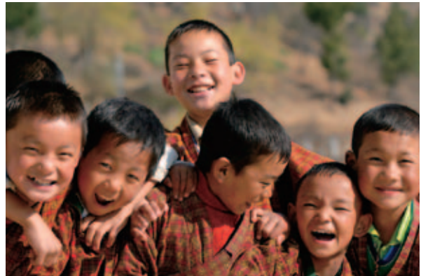
Photo 3 School Children