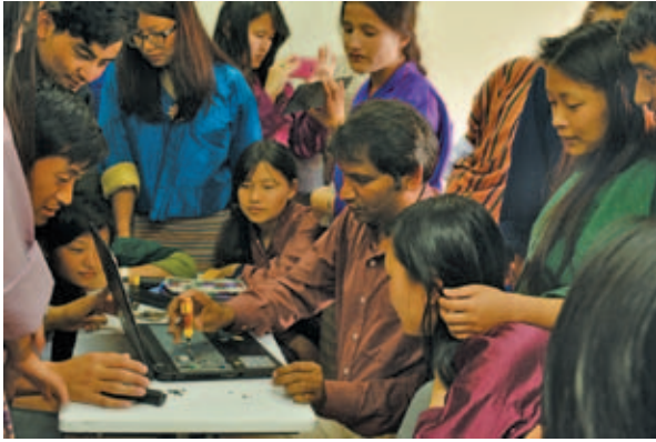
Photo 5 Student learning computer hardware