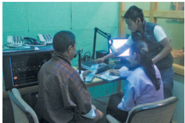
Photo 11 Radio Broadcasting by Sherubtse Students