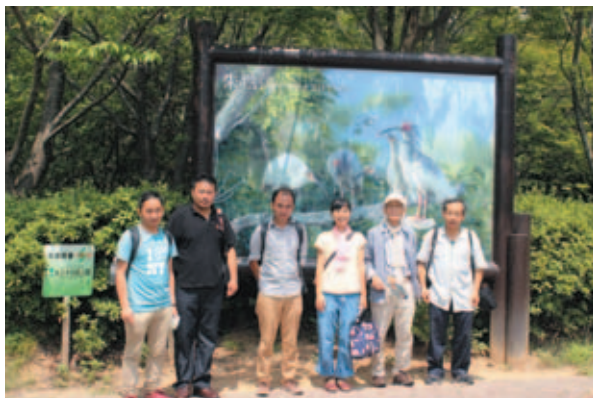
Photo 2 Sado Island