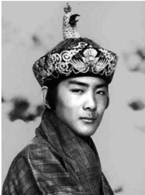
Photo 1 His Majesty King Jigme Singye Wangchuck The Fourth King of Bhutan