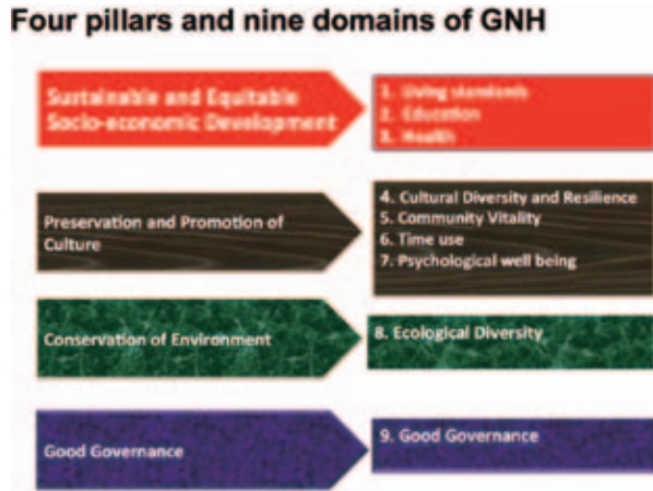
Figure 2 Pillars of GNH